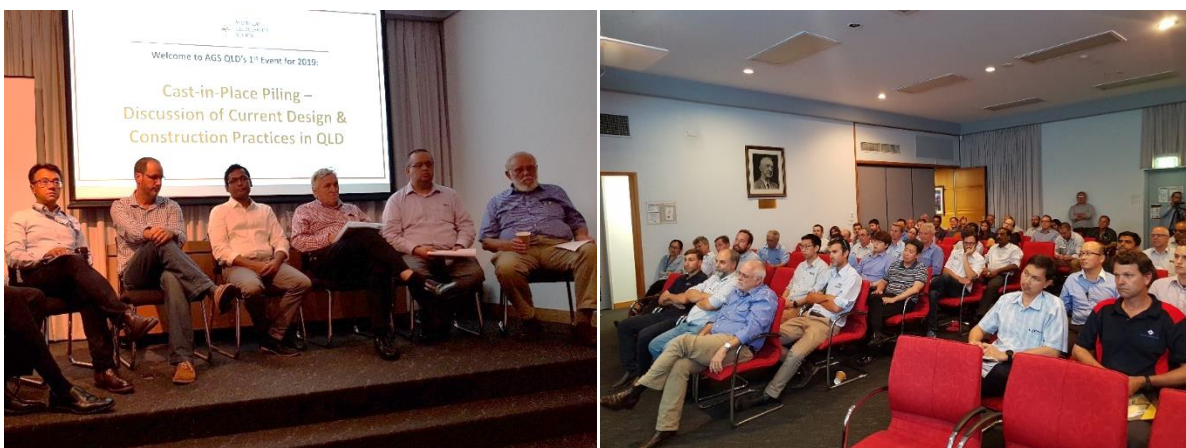
Figure 1. AGS Queensland Chapter panel discussion held on 21 February 2019