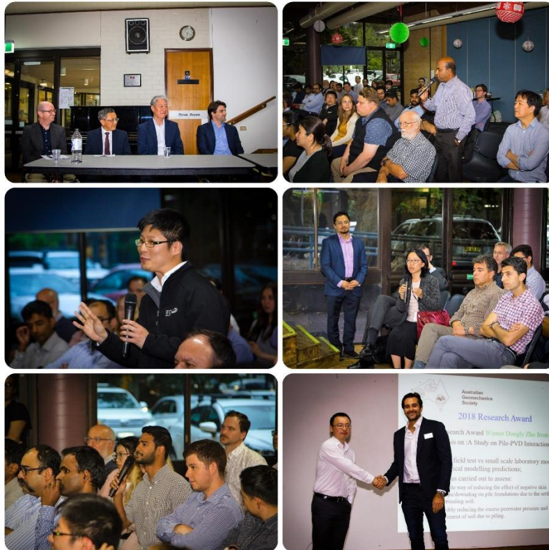
Figure 2. AGS Sydney Chapter debate night held on 12 December 2018