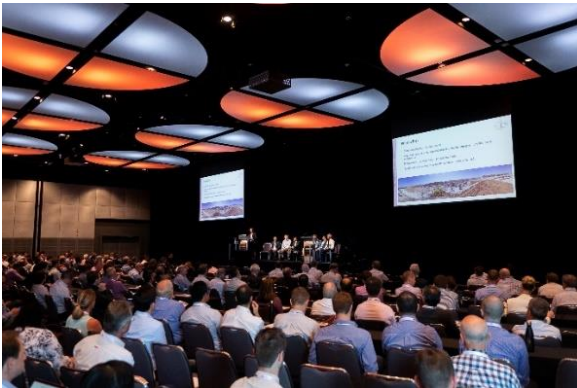
Figure 9 Audience during the panel discussion

https://www.issmge.org/corporate-associates/corporate-associates-presidential-group